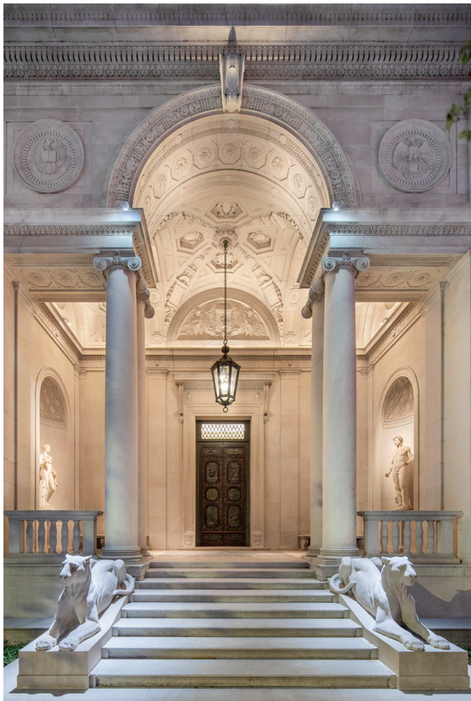
The original entrance to J. Pierpont Morgan's Library, evening view.

T his multiyear project restored the exterior of one of the finest examples of Neoclassical architecture in the United States and the historic heart of the Morgan. It also enhanced the surrounding grounds, improved the exterior lighting of the building, and increased public access to and appreciation of this historic architectural treasure. The Morgan Garden opened to the public on June 18, 2022, for its inaugural season. We are immensely grateful for the donors who made this restoration possible.