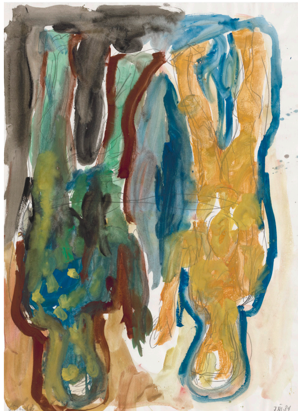
Georg Baselitz (b. 1938), Untitled [drawing], 1984. The Morgan Library & Museum, Gift of the Baselitz Family, 2022.107. © 2024 Georg Baselitz.