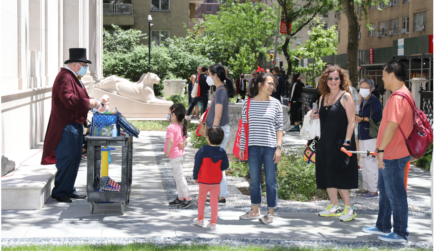
Garden Family Fair and Free Community Weekend.

Fiscal year 2023 saw a triumphant return to in-person school programs. “Exploring with the Morgan” served 7,114 K–12 students in FY23, targeting underserved communities in Manhattan, the Bronx, Queens, Brooklyn, and Staten Island. Three core programs presented in the Horace Goldsmith Foundation Education Center and in school classrooms offered students the opportunity to incorporate primary sources from the Morgan into their study of social studies, art, and science: