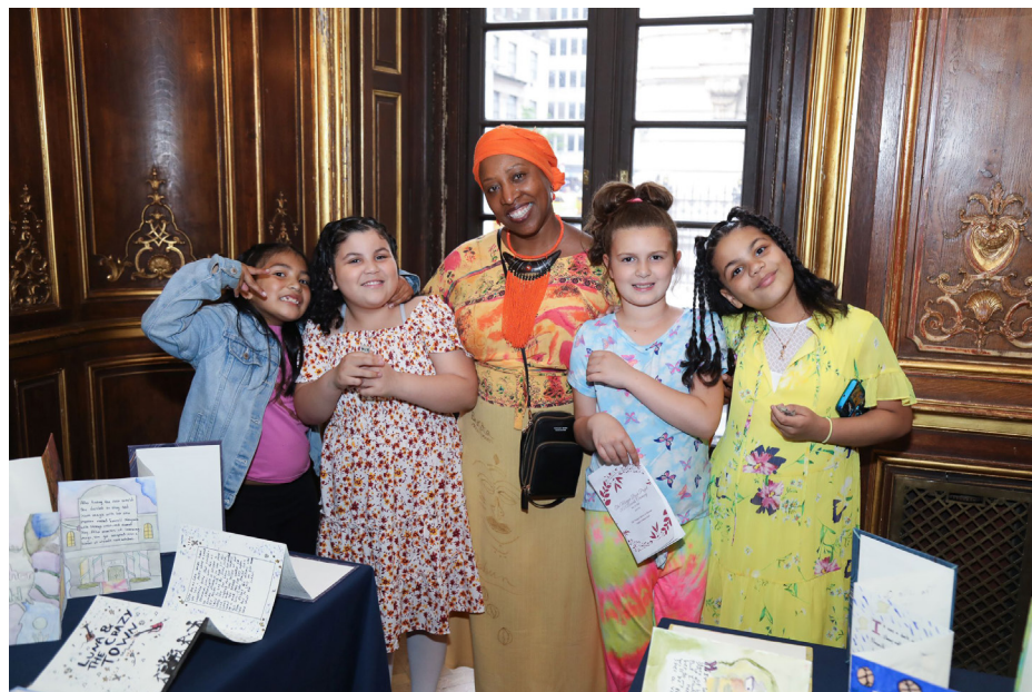
Group photo with teacher and students from P.S. 46 Edward C. Blum at the Morgan Book Project Awards Ceremony.