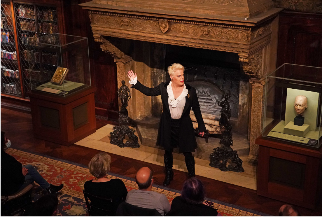
Eddie Izzard Performs Charles Dickens's Great Expectations to Celebrate Their Shared Birthday, February 7, 2023.