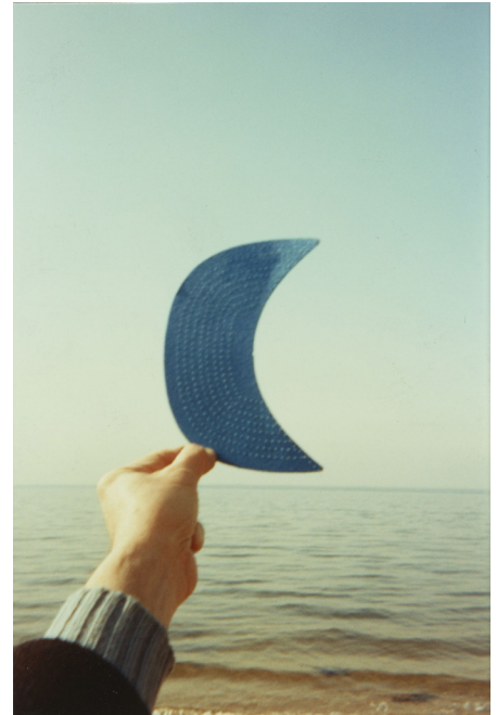
Ray Johnson (1927–1995), bill and Long Island Sound, Winter 1992. Commercially processed chromogenic print; 6 × 4 in. (15.24 × 10.16 cm). The Morgan Library & Museum, Gift of the Ray Johnson Estate