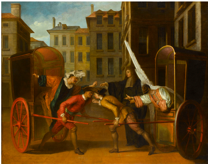
Claude Gillot (1673–1722), Scene of the Two Carriages , ca. 1710–12. Oil on canvas. Département des peintures, Musée du Louvre, Paris; RF2405.