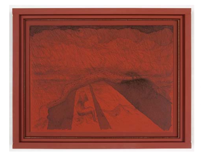
Matthew Barney RIVER ROUGE: Crown Victoria , 2011 Ink on paper in painted steel frame 11 3/8 x 14 3/8 x 1 1/2 inches (28.9 x 36.5 x 3.8 cm) Julia Reyes Taubman and Robert Taubman Copyright Matthew Barney

materials in his most recent drawings. Many sheets that relate to the second act of RIVER OF FUNDAMENT , which took place in Detroit in October 2010, include metals and minerals, such as gold, silver, lapis lazuli, and sulfur. These symbolic substances emphasize the link between ancient myths and contemporary America that is at the core of RIVER OF FUNDAMENT .