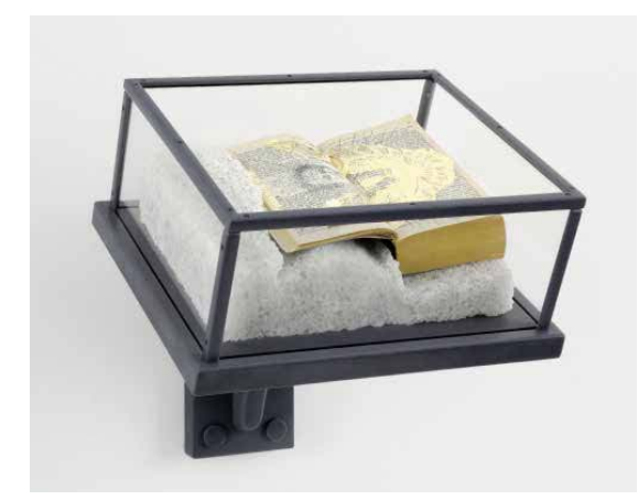
Matthew Barney Ancient Evenings: Ba Libretto, 2009 Ink, graphite and gold leaf on paperback copy of Ancient Evenings by Norman Mailer, on carved salt base, in nylon and acrylic vitrine 15 1/2 x 13 3/4 x 14 3/4 inches (39.4 x 34.9 x 37.5 cm) Marguerite Steed Hoffman, Dallas Copyright Matthew Barney

This metaphorical mixing becomes increasingly visible in Barney's work as he turns to the Egyptian-mythology-themed action of his seven-part RIVER OF FUNDAMENT , based on the first one hundred pages of Norman Mailer's novel Ancient Evenings . The drawings related to RIVER OF FUNDAMENT —which comprise approximately one third of the exhibition—explore possible narratives in connection with the performances and films that make up the work.