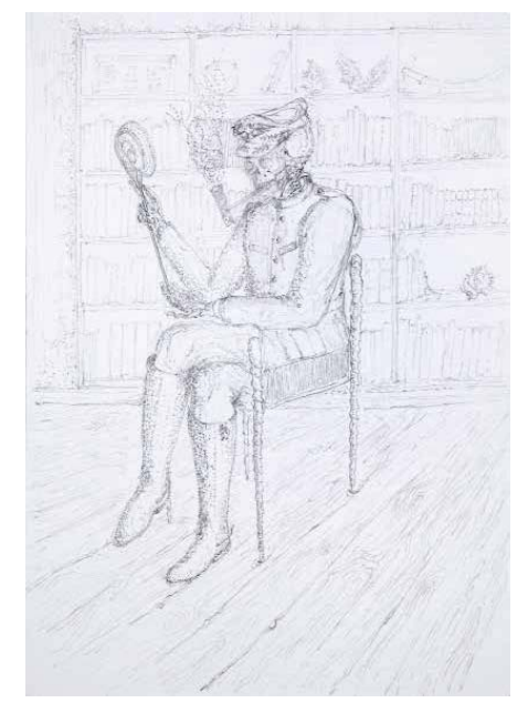
Matthew Barney Mirror Position, 2006 Graphite on paper in self-lubricating plastic frame 13 1/2 x 11 1/2 x 1 1/4 inches (34.3 x 29.2 x 3.2 cm)