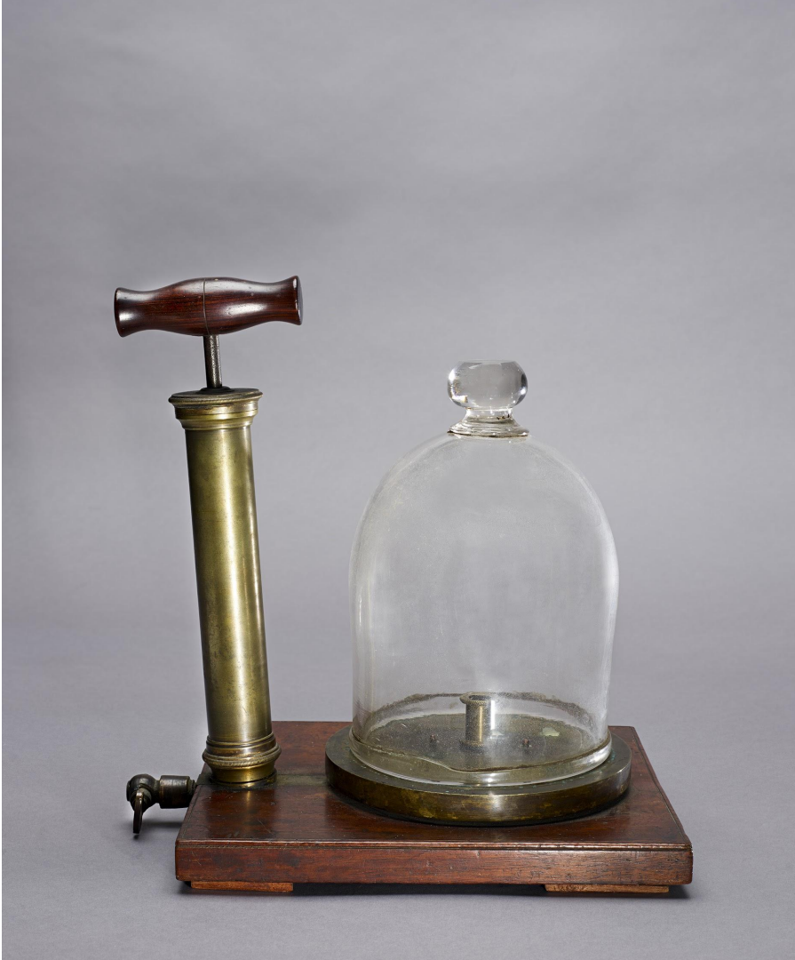
Vacuum pump with bell jar, ca. 1800–1850. Division of Medicine and Science, National Museum of American History, Smithsonian Institution