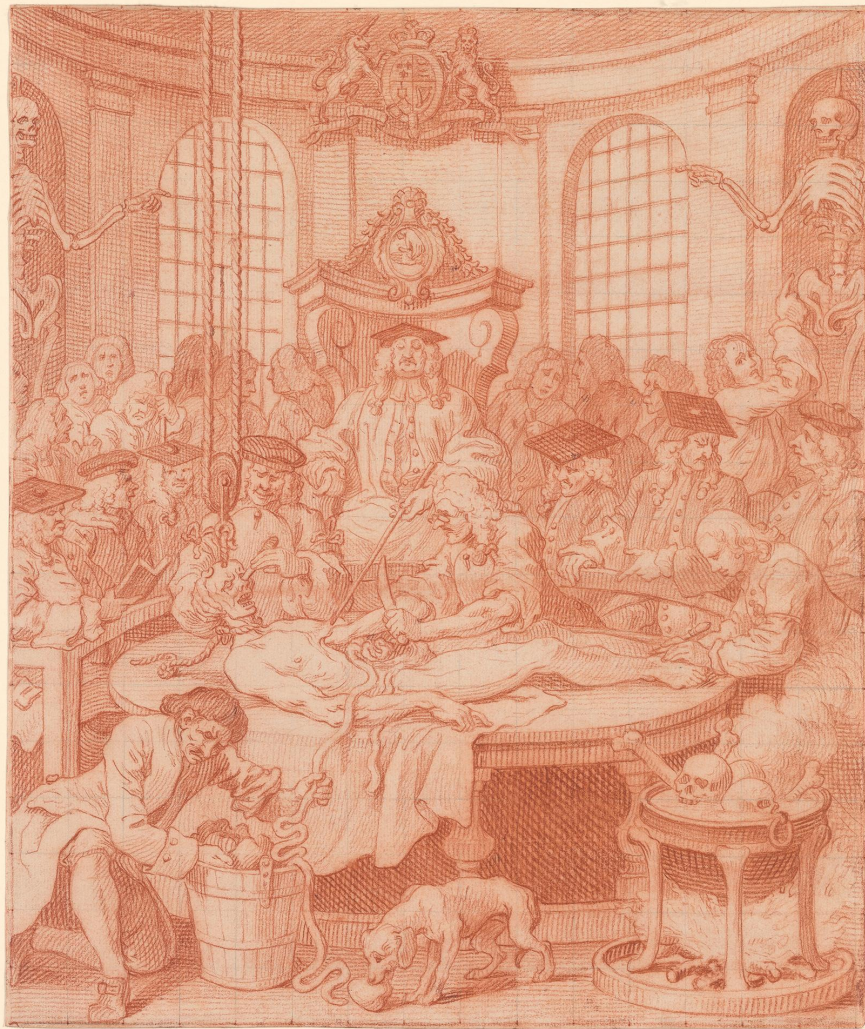
William Hogarth (1697–1764), The Reward of Cruelty , ca. 1751, red chalk with smudging, squared in graphite, on laid paper, incised with stylus; verso rubbed with red chalk for transfer. The Morgan Library & Museum, purchased by Pierpont Morgan in 1909, III, 32e.