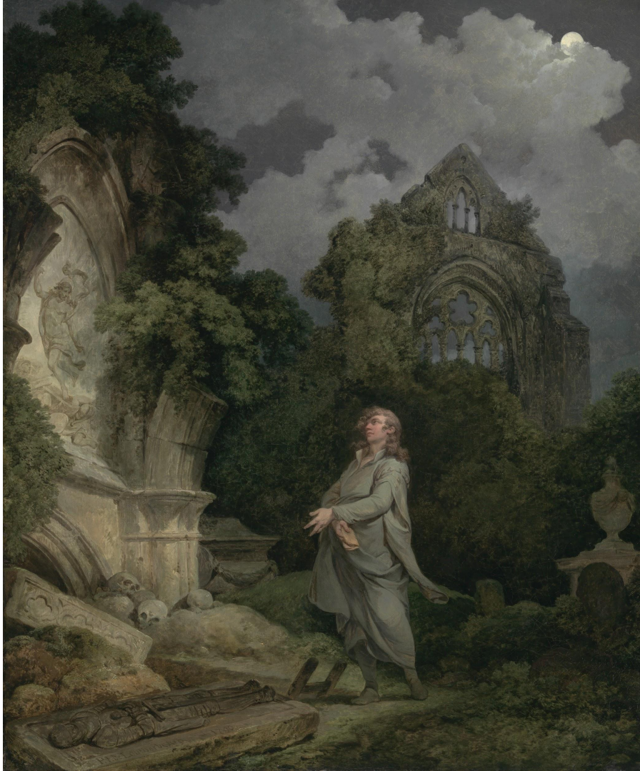
Philippe-Jacques de Loutherbourg (1740–1812), A Philosopher in a Moonlit Churchyard , 1790, oil on canvas. Yale Center for British Art, Paul Mellon Collection.