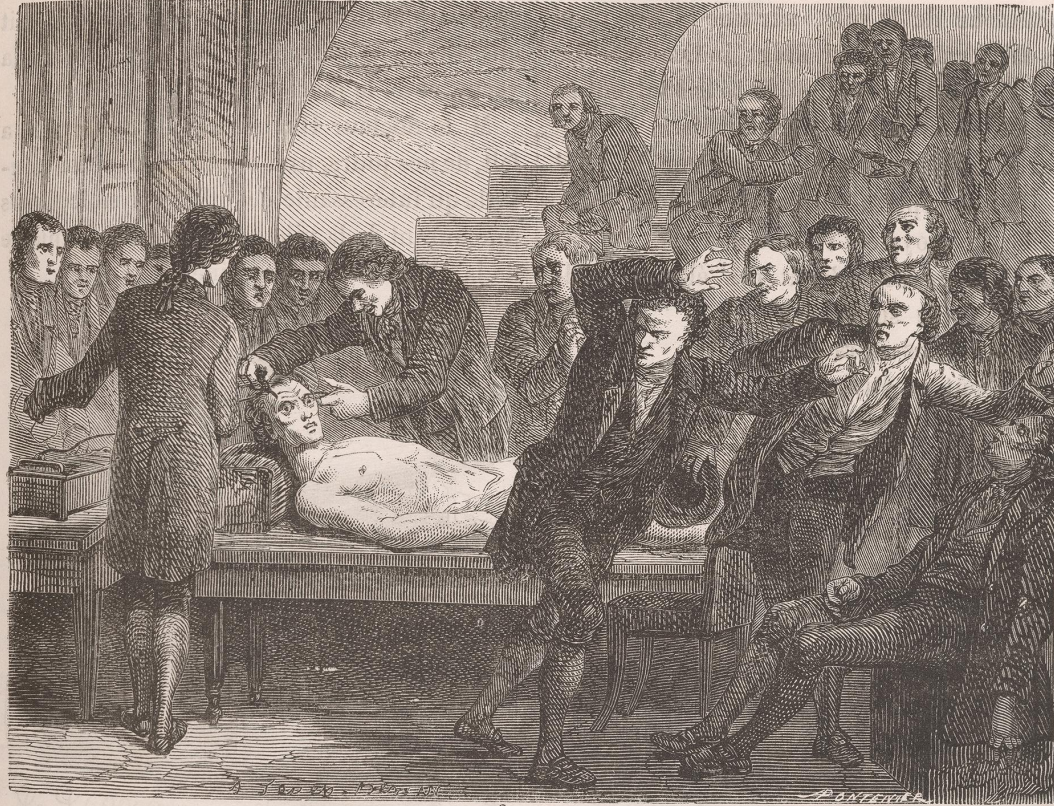
Fig. 333. — Le docteur Ure galvanisant le corps de l'assassin Clydsdale.

Auguste Pontenier (1820–1888), wood engraving in Louis Figuier (1819–1894), Les merveilles de la science, ou Description populaire des inventions modernes , Paris: Furne, Jouvet et cie., 1867–70. The Morgan Library & Museum, purchased on the Gordon N. Ray Fund, 2016, PML 196256.