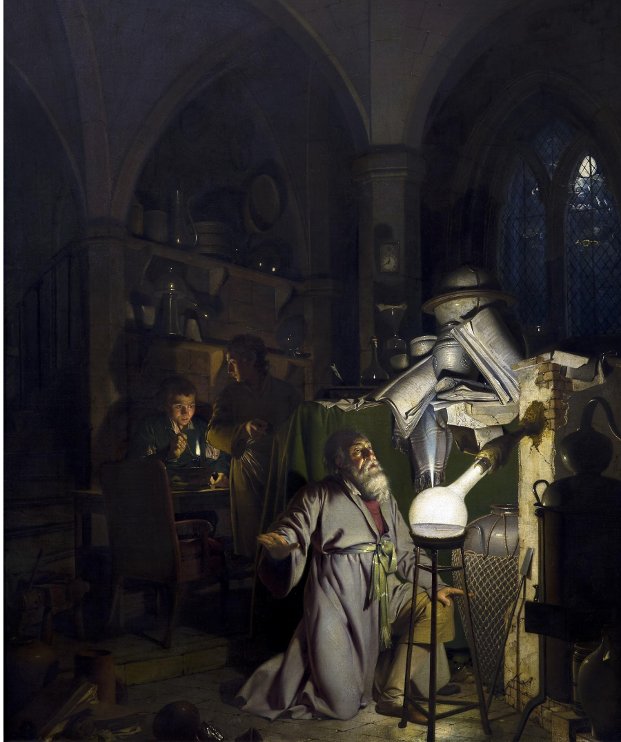
Joseph Wright, The Alchemist, in Search of the Philosopher's Stone, Discovers Phosphorus, and Prays for the Successful Conclusion of His Operation, as Was the Custom of the Ancient Chymical Astrologers , exhibited 1771, reworked and dated 1795, oil on canvas. Derby Museums Trust.