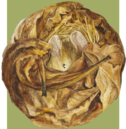
Design for a greetings card, 1890. Linder Bequest. Museum no. BP.442(a) & (b).