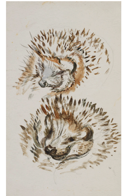
Drawing of a hedgehog, assumed to be Mrs. Tiggy, by Beatrix Potter, about 1904. Linder Bequest. Museum no. BP.495.

ACTIVITY: Next time you visit an outdoor place such as a yard, park, or garden, collect different natural items such as a leaf, rock, or acorn.