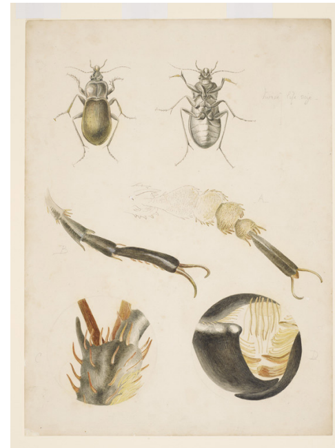
Drawing, magnified studies of a ground beetle ( Carabus nemoralis ), by Beatrix Potter, about 1887. Linder Bequest. Museum no. BP.257. © Victoria and Albert Museum / London, courtesy of Frederick Warne & Co. Ltd.

Look closely at Potter's drawings of animals. How do different views of the same animal change how we see it?