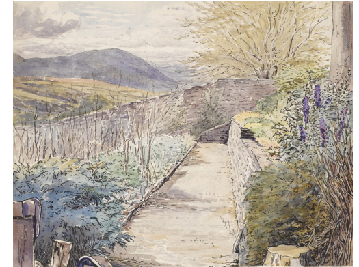
Drawing of a walled garden, Ees Wyke (previously named Lakefield), Sawrey, ca. 1900. Linder Bequest. Museum no. BP.238.

Beatrix Potter explored mountains, woodlands, old ruins, gardens and open spaces when she went to the English countryside on vacation each summer. She observed the landscape and made sketches like this one.